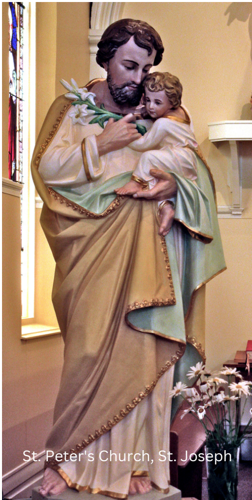
St. Peter's Church, St. Joseph