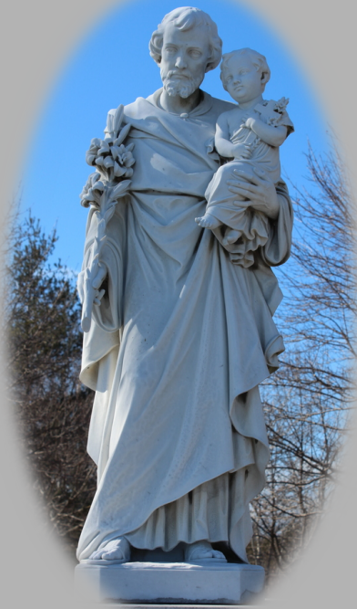
St. Joseph Memorial Park