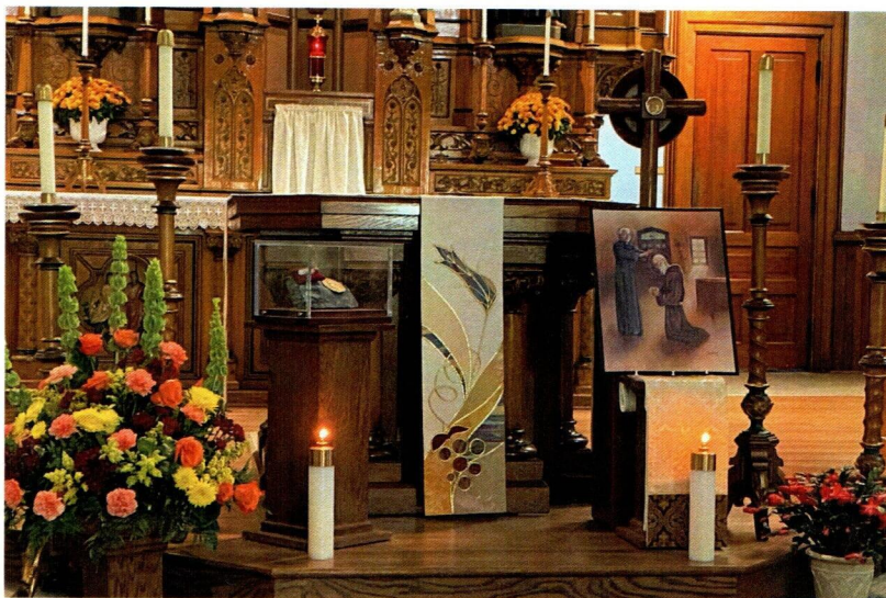
The two holy men together again! The Major Reliquary of Saint André Bessette, CSC, stopped at the Solanus Casey Center, in Detroit. After Mass, there was time for prayer and public veneration in the Chapel of the Capuchin Monastery.

"Two men, one mission: opening the door to God's love!"